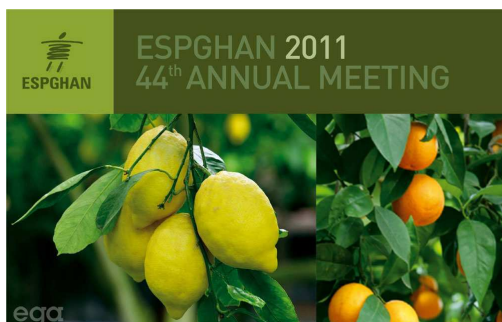
See you in Sorrento